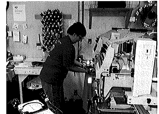
Embroidery / Sewing