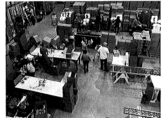
Shipping / Receiving / Packaging